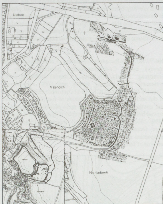
Figure 2. Large area magnetometric survey of hillfort Přistoupim (11 ha).

ploughed out prehistoric and Early medieval hillforts near Vepřek and Bosyně, both in district Mělník. The example of results of systematic magnetometric survey (approx. 2,5 ha) of Early medieval/Iron age hillfort near Bosyně (Křivánek 2003) we can use as for separation of the whole fortified site as for identification of different subsurface archaeological situations (fig. 1). Magnetometric survey on very long and narrow headland separate different transverse systems of fortification (outer single ditch, inner ploughed out main fortification system ditch-rampart-ditch) and also very probable entrance to the hillfort. Inside of fortified area were then identified groups with larger subrectangular sunken settlement features approx. 5x3 m (probable houses), smaller sunken features (probable pits) and relics of line of ploughed out probable perimeter fortification.